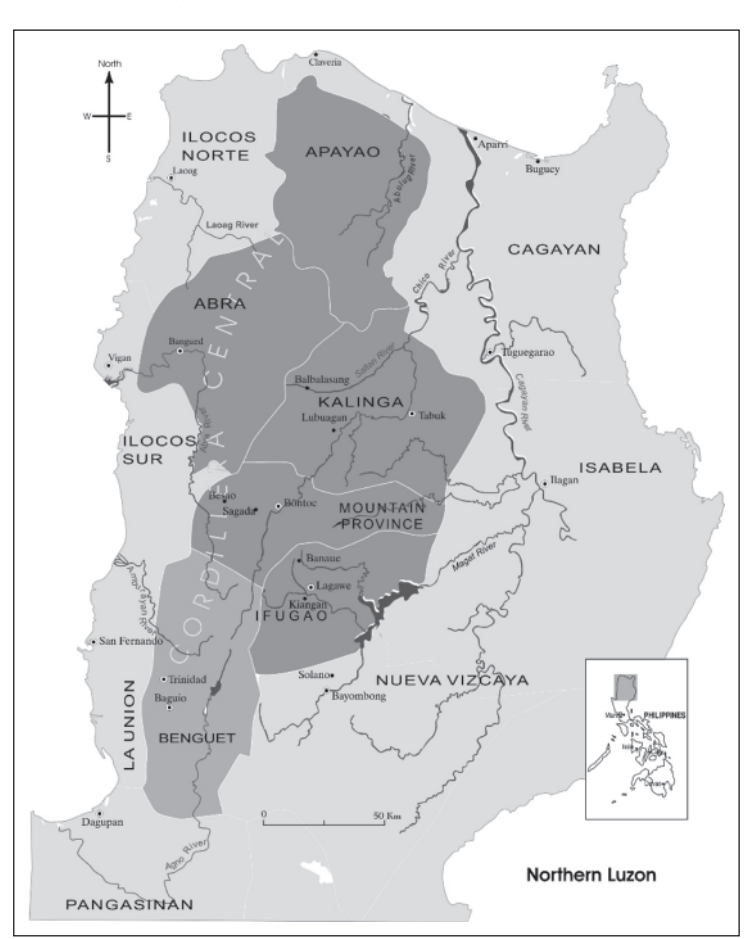
Figure 1: Northern Luzon, Philippines

So that you buy a diaper So that the baby will wear it