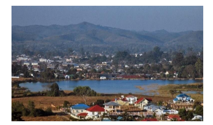
Figure 5. Maymyo (Pyin U Lwin), behind Kandawgyi Lake

Similarities of Characteristics of British Hill Stations in South Asia and Mainland South East Asia: British India, Ceylon, Burma and British Malaya