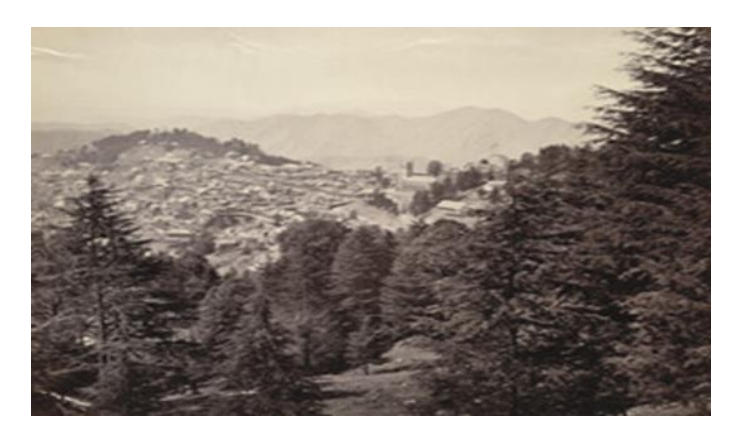
Figure 2. Hill station of Simla, 1865

carved eaves and gables, complemented the solid stone British-style houses. In the surrounding areas were tea plantations.