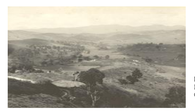
Figure 4. The Valley at Nuwara Eliya ca.1900