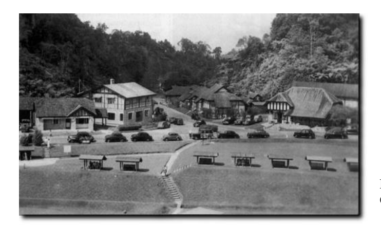
Figure 6. Fraser's Hill

Cameron Highlands is on a plateau, at the height of 4,921 feet, with the size of Singapore (275 square miles) in the Titiwangsa Mountain Range. The city ranking for Cameron Highlands was agriculture (vegetable farms) and tea plantations like the Cameron Bharat Plantation and the Sungai Palas Boh plantation. The purpose of the area was, as suggested in the 1927 Handbook to British Malaya that the highlands of Pahang might also become a retirement community for Europeans. The main town, at the centre of the hill station, is Tanah Rata. The purpose of Tanah Rata was the administrative centre for Cameron Highlands. The different parts of the specification of the layout of Tanah Rata were the circulatory part with roads, streets, and lanes. An educational/religious part with schools and churches. A built up part with bungalows and houses. Tanah Rata had one main thoroughfare and some side streets. The main facility was a golf course. The architecture in Cameron Highlands had buildings designed in the English Tudor Revival style and the black- and-white Tudor Revival style (Crossette, 1999a). Other buildings were designed in black and white, which is considered the black-and-white Tudor Revival style and architecture in the Chinese shop house style. In the surrounding areas of Cameron Highlands were agriculture (vegetable farms) and plantations with the Cameron Bharat Plantation and the Sungai Palas Boh plantation.