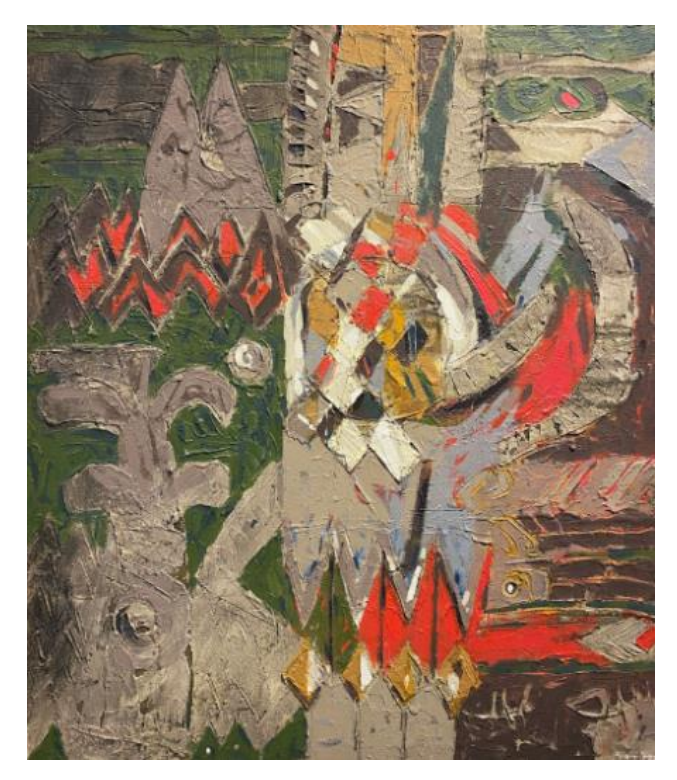
Figure 4: Awang Damit Ahmad, Saging dan Pucuk Paku (EOC Series), 1992, Mixed, media on canvas, 106 x 91.5 cm (Extracted from "Lot 26 | 20 February 2022" [n.d.].)

In this research, we have selected these two artists because of their prominence and have been established as icons of abstract art based on biographical information and their active participation in art. Yusof Ghani and Awang Damit Ahmad are two prominent figures in the area of abstract art in the country who are proficient at creating abstract works. In terms of formalistic qualities, these two figures have various abstract styles; the movement of the lines from the brush effect, the shift in colour that generates space, and the touch of texture from the experiments with materials influence the translation. As far as the basic understanding and knowledge of art based on formalistic elements are unable to translate abstract works, it can be seen that formalistic elements are unable to translate their abstract works by evaluating them from a deeper perspective and examining the exhibited psychological angle. This is where the role of eastern aesthetic appreciation and philosophy comes into play, revealing the religious and cultural content of Malay artists' abstract works.