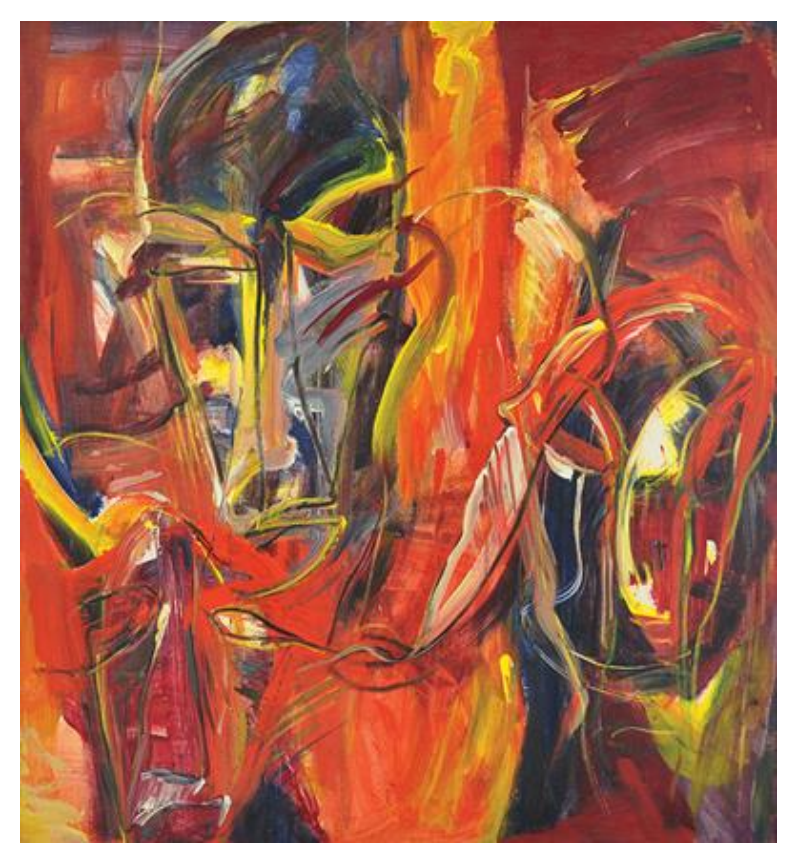
Figure 1: Siri Topeng Jerantut, 1995, Oil on canvas, 93 x 85.5 cm (Extracted from "Yusof Ghani (B. Johor, 1950)" [n.d.].)

Analysing his "Siri Topeng" (Mask Series), as seen in Figure 1, the viewer will experience mystic emotions, threats, and danger when viewing the series' works, as seen in his painting in Figure 3. This is due to the fact that the series of masks reflect the indigenous culture, particularly in Borneo, Sabah, and Sarawak. In actuality, his other painting in Figure 2 from "Siri Hijau" (Green Series) is an application of spiritual principles through nature or the natural landscape. Hijau is an exhibition of paintings displayed at the Petronas gallery in 2002, presenting a succession of works by painters who followed the same formalistic principles but had diverse subject allusions, focusing on the greenery of nature, life, and ecology. Yusof Ghani reveals the natural world that provides a broad perspective, both above and below, as well as the metaphor of the valley of life as a mountain.