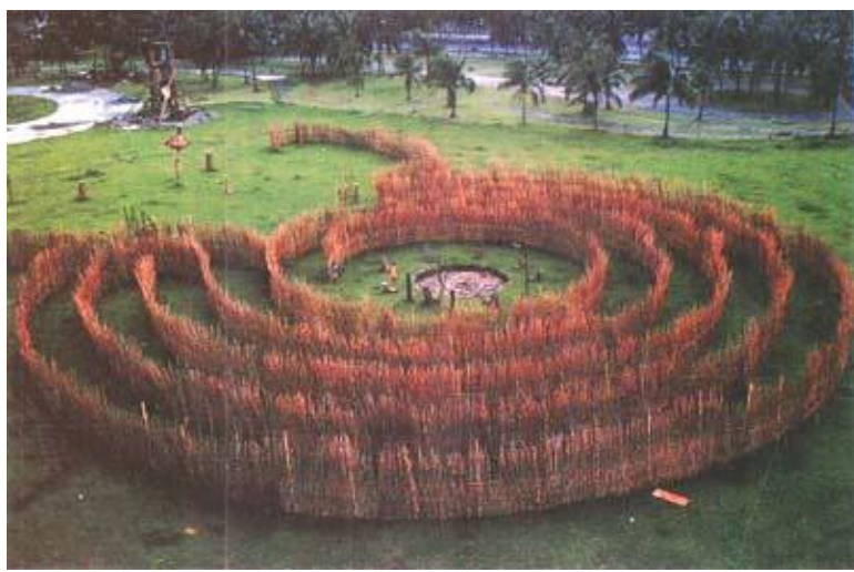
Figure 2. Top view image of Roberto Villanueva installation, "Cordillera Labyrinth," 1989 at the Installation Cultural Center of the Philippines open field.<sup>11</sup>

The contemplation that constitutes the highly elusive question of construing the "Philippine in Philippine art" continued to struggle even during the post- Marcos era. The newly installed officers re-orients the CCP's goal towards the Filipinization of art production of the CCP through "the encouragement of original works by Filipino artists, and the development of new forms of artistic expressions deriving primarily from indigenous traditions." (Sta. Maria, 1998) The stance of Sta. Maria is a conscious reminder of its Filipino inheritance and at the same time a strategic critique directed upon "copies" and western artistic hegemony.