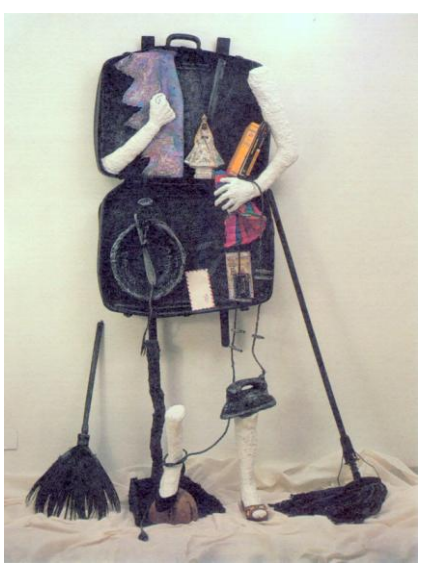
Figure 4. Imelda Cajipe Endaya's My Wife is a DH", 199516