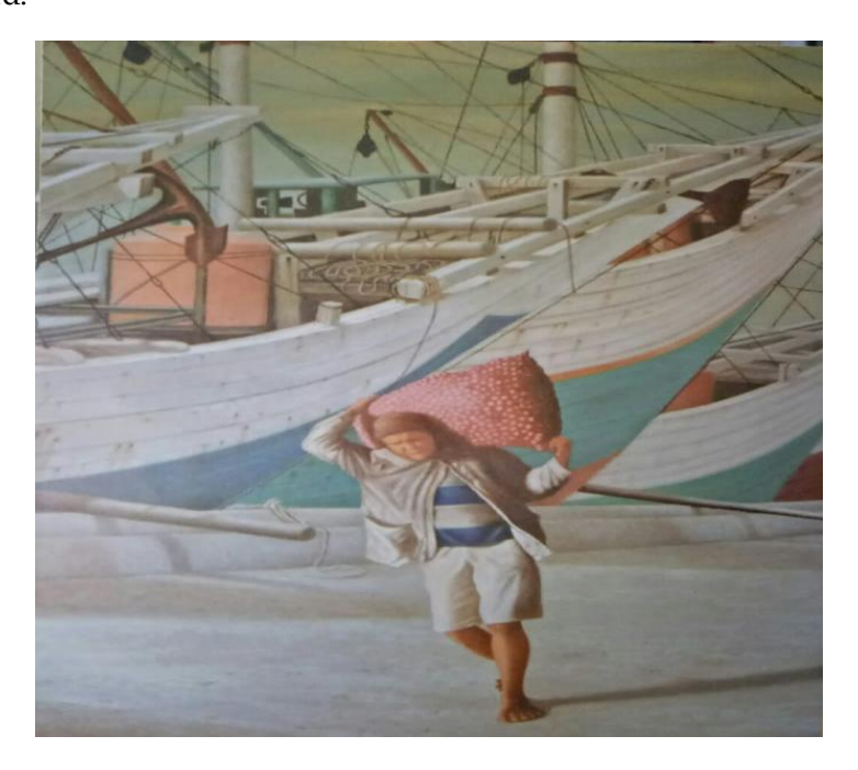
Figure 6: Oil painting "Berlabuh di Dermaga" (Anchored on the Dock) on canvas 100 cm length x 138 cm width painted by Rusli (Collection of Dinas Kebudayaan Provinsi Riau)

porter who is picking up goods. The principle signs depicted in the painting are the image of the porter and the ships in the dock. Porters picking up goods are commonly found at any port alongside rivers. It provides an image of somebody who is poor but has strength, and that the ships are the sea transportation model that brings the resources in huge quantities. This painting portrays the dock as an important role in Malay economic activity with many ships anchored there. It tries to depict that the development of cities on Malay land started from the ports along the rivers. However, the Malay people are on the weakest side of the dock. From the principle signs, it seems that the images in the painting symbolise that "The strength of the Malays still exists even though they are not lucky enough in their homeland."