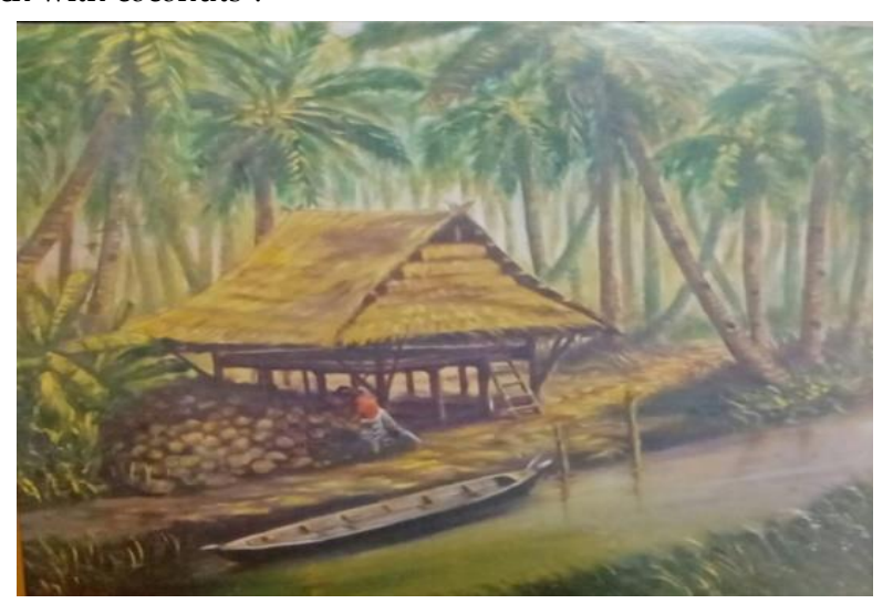
Figure 11: Oil painting "Langkau Kuala Sungai Indragiri" (Indragiri River Estuary) on canvas 90 cm length x 80 cm width painted by Adi Lukis (Collection of Dinas Kebudayaan Provinsi Riau)

economic activity of people by the Indragiri River whose living is earned from coconuts and its derivate products. It is as if it is trying to say through the painting, "we are rich with coconuts".