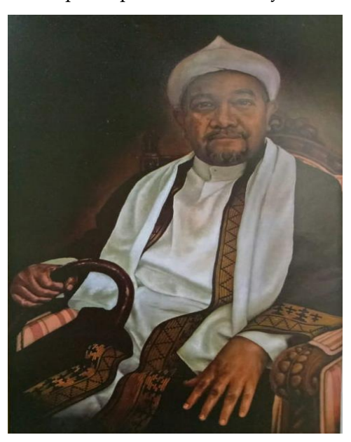
Figure 12: Oil Painting "Tuan Guru Pesantren" (Male Religious Teacher of Islamic Boarding School) on Canvas 140 cm Length x 90 cm Width painted by Yudi YS (Collection of Dinas Kebudayaan Provinsi Riau)

The existence of the image in the painting represents the existence of a strong relation between Islam and the Malay people. The preacher's image, which was selected as the centre of the attention in the painting, is intended to send a message that he has a special place in the Malay land.