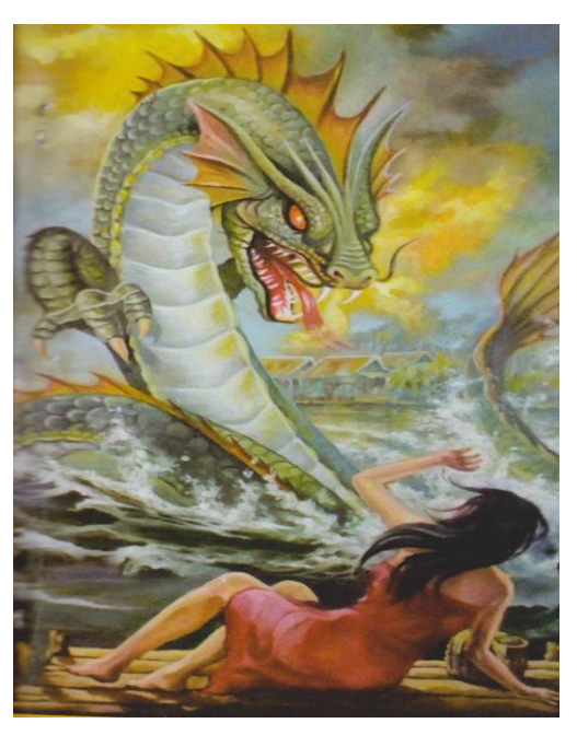
Figure 1: Oil painting "Mitos Sungai Siak (the myth of Siak River) on canvas 100 cm length x 60 cm width painted by Refnaldi (Collection of Dinas Kebudayaan Provinsi Riau)

The construction of the Malay-river deals with myth and culture. Like other ethnic groups, the Malay also have myths and cultures integrated into their life. The myths of the rivers and patterns of Malay culture are found in several paintings: The Malay-River-Myth in this painting is constructed through the images of the dragon of Siak River, a young lady, and the river (Figure 1). The principle sign of this painting is the anger of the dragon to the young lady. The painting captures a dragon that looks very angry. It opens its mouth wide and shows its tongue, teeth, and red eyes.