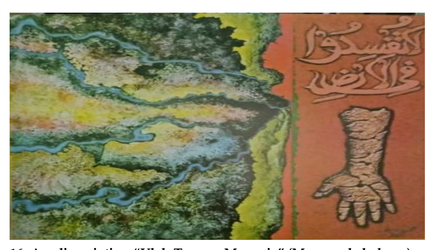
Figure 16: Acrylic painting "Ulah Tangan Manusia" (Man-made behave) on canvas 100 cm length x 100 cm width painted by Armen Titof (Collection of Dinas Kebudayaan Provinsi Riau)

The painting entitled "Ulah Tangan Manusia" (Man-made behave) (Figure 16) constructs the Malay-river and the dark side of civilisation through three main