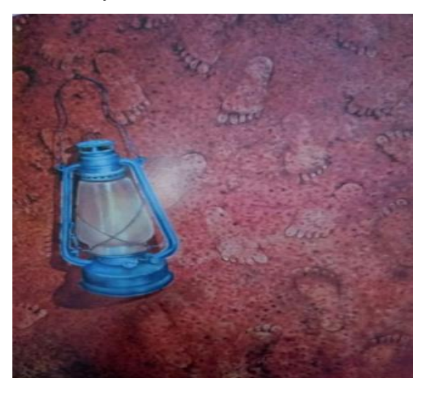
Figure 5: Acrylic painting "Destination" on canvas 130 cm length x 150 cm width painted by Kodri Johan (Collection of Dinas Kebudayaan Provinsi Riau)

The analysis of this study considers the principle sign in this painting as being the "kerosene lamp without the light", which is trying to send the message "light on the ancestors' dreams and hope through the local knowledge," and you will achieve a better life as your "destination".