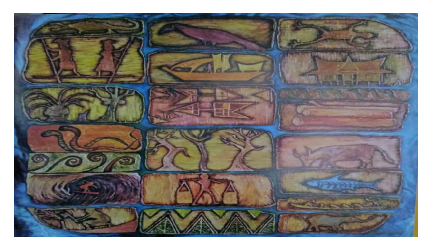
Figure 15: Acrylic Painting "Dampak" (impact) on Canvas 80 cm Length x 80 cm Width painted by Armen Titof (Collection of Dinas Kebudayaan Provinsi Riau)

forest, which caused the natural imbalance of the ecosystem in the Malay land, but also tries to send a message that "the Malay identity will perish in the end". This painting simply implies social criticism of civilisation that causes natural and social destruction.