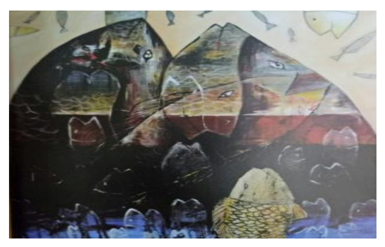
Figure 19: Acrylic painting "Suara Pribumi" (The Voice of the Indigenous People) on canvas 120 cm length x 100 cm width painted by Rahmad Dani (Collection of Dinas Kebudayaan Provinsi Riau)

The painting entitled "Suara Pribumi" (The Voice of the Indigenous People) (Figure 19) constructs the dark side of civilisation through the elements, the use of dark colour, and various sizes of unhappy fish. These fish are trying to reach the water's surface as if they intended to convey a message to the world "we are not happy here". In line with the title, "Suara Pribumi" (The Voice of Indigenous People), this painting portrays the voice or dreams of the Malays due to the marginal condition they encounter. Sociologically, the voice of the indigenous Malays is indeed marginalised in the modern civilisation in this present day. The Malay people feel unhappy in their land, a land that is supposed to be giving them prosperity. Indeed, now they are marching to seek attention on the surface. It seems that they feel that they are losers in their homeland. Therefore, the principle signs of this picture try to depict fish marching to the surface.