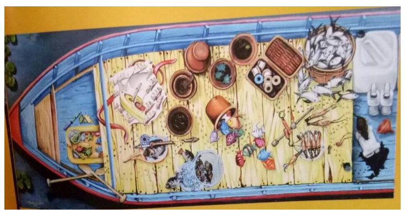
Figure 14: Oil Painting "Jejak Tikus #2" (Footsteps of the Rats #2) on Canvas 140 cm Length x 60cm Width by Ferdian Ondira Asa) (Collection of Dinas Kebudayaan Provinsi Riau)

through the images of the rat's footsteps. The principle signs in this painting are the rat's footsteps. Rats in Malay culture symbolise a particular meaning, e.g., thieves or perpetrators of corruption. This painting shows the damage that occurred because of corruption in the Malay land. Corruptive behaviour has destroyed the Malay land and even the nation. The rats were trying to break the boat, which can be interpreted here as the nation, while the various kinds of goods scattered on the boat indicate the national resources.