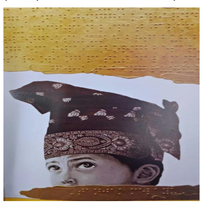
Figure 4: Acrylic painting "Tanjak Tebing Runtuh" (The Broken cliff Headdress Shape) on canvas 120 cm length x 80 cm width painted by Habi Maulana (Collection of Dinas Kebudayaan Provinsi Riau)

The construction of the Malay-river-myth is depicted in the painting entitled "Tanjak Tebing Runtuh" (Figure 4). Tanjak Tebing Runtuh is a traditional Malay headdress. Tanjak is a kind of headdress that wraps around the head. The idea is that this traditional headdress comes from the broken cliff near the river because of the erosion of the river banks in the past. There are many types of tanjak , each of which contains a philosophy. The more complex its shape means the higher the position of those who wear it. Tanjak are usually used by a male figure in Malay society, and symbolises a social class or authority.