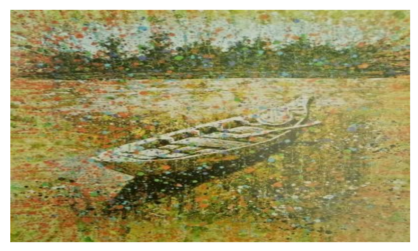
Figure 7: Acrylic painting "Penantian I" (Waiting I) on canvas 60 cm Length x 50 cm Width painted by Alza Adrison (Collection of Dinas Kebudayaan Provinsi Riau)

river can be made use of by the Malays. The boat in the painting can be seen as a transportation object explicitly and as an effort implicitly by the Malays to pick up their hope. Waiting can be implicitly interpreted in this painting as not being a useless wait, but waiting for hope and that the hope itself should be picked up through effort. The "I" character in the title means that the Malays will continue to struggle to pick up their hope. Nevertheless, the splashes of multicolour in this painting give the impression of the sense of effort, that the waiting is more challenging and complex and not effortless. However, the selection of these multicolour splashes in bright context seems an attempt to send the message that the Malay people will live in harmony and that they are optimistic and have an excellent attitude in picking up their hope.