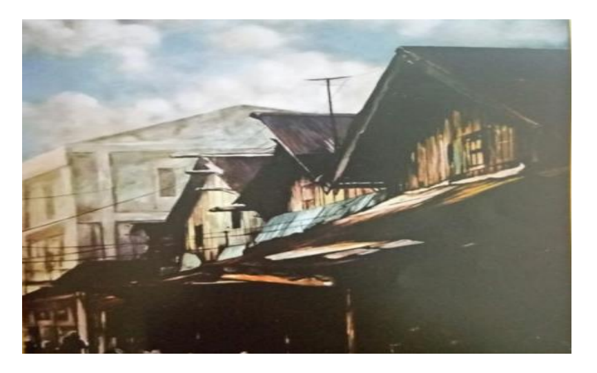
Figure 20: Acrylic painting "Pasar Tepian Sungai Siak" (A Market by the Siak River) on canvas 120 cm length x 110 cm width painted by Dasril (Collection of Dinas Kebudayaan Provinsi Riau)

The painting entitled "Pasar Tepian Sungai Siak" (A Market by the Siak River) (Figure 20) constructs the dark side of civilisation through the elements of the poor image of Pasar Bawah market, which is situated on a bank of the Siak River, Pekanbaru. Historically, the market is essentially at the beginning of Pekanbaru city. The principle image of the painting depicts two parts of the building situated side by side. On one side, an old building stands, which is made of board and the roof is rusty, owned by a local Malay. In contrast, on the other side, a concrete shophouse building stands owned by migrant people. The old building represents the old life that is still present, but it is more and more threatened by the development that focuses on economic development rather than social development. This painting shows the condition of economic rivalry in the civilisation of Pekanbaru city. The rivalry threatens social interaction and the behaviour is becoming more individual and selfish. The presence of shop houses is a symbol of economic power that is concerned more with money than social relations. Nevertheless, this painting tries to send a message that the local Malays were defeated in their homeland".