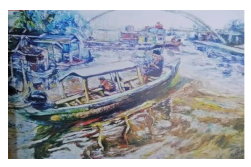
Figure 9: Oil painting "Aktivitas di Sungai Siak" (Activities by the Siak River) on canvas 80 cm length x 120 cm width painted by Ibrahim) (Collection of Dinas Kebudayaan Provinsi Riau)

The painting entitled "Aktivitas di Sungai Siak" (Activities by the Siak River) (Figure 9) constructs the Malay-river-spirit of life in the images of the river, transportation boats, cargo ship, houses near the banks, and the Siak bridge. The principle sign in this painting is the activities in the river (Siak). The analysis of this study in this painting is that these images are closely related to the daily activities in the Siak River.