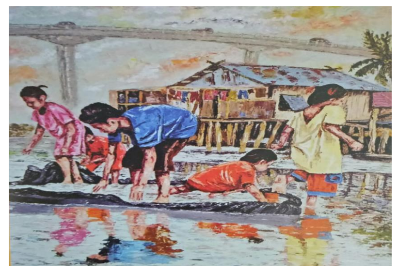
Figure 18: Oil Painting "Leighton I" on Canvas 100 cm Length x 100 cm Width painted by Yulianto (Collection of Dinas Kebudayaan Provinsi Riau)

The painting entitled "Leighton I" (Figure 18) constructs the dark side of civilisation through the elements of the Siak River, Leighton I Bridge, children fishing, and the poor houses near the river banks. Presently, the Siak River and Leighton I Bridge are two iconic places of Pekanbaru city. This painting tries to depict the life of the Malays on the banks of the Siak River. The Malay images in the painting are somehow being presented as livelihood activities, e.g., fishing and other activities, which are strongly related to Siak River. Leighton I Bridge over the Siak River gives the image that civilisation keeps running in the Malay land. This bridge is somehow presented as the symbol of advancement or civilisation of a region, which also reflects and connects between the past and present day of Pekanbaru.