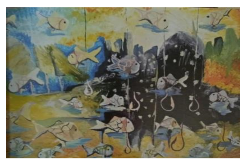
Figure 8: Acrylic painting "Memancing" (fishing) on canvas 150 cm length x 100 cm width painted by Debby Nurianto (Collection of Dinas Kebudayaan Provinsi Riau)

The painting entitled "Aktivitas di Sungai Siak" (Activities by the Siak River) (Figure 9) constructs the Malay-river-spirit of life in the images of the river, transportation boats, cargo ship, houses near the banks, and the Siak bridge. The principle sign in this painting is the activities in the river (Siak). The analysis of this study in this painting is that these images are closely related to the daily activities in the Siak River.