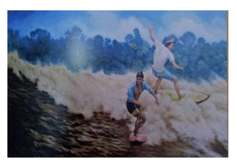
Figure 3: Oil painting "Bono" on canvas 140 cm length x 80 cm width painted by Indra Maiyeldi (Collection of Dinas Kebudayaan Provinsi Riau)

The construction of the Malay-river-myth is also marked by a painting entitled "Bono". Bono is a typical long wave that runs along the Kampar river and shows two surfers on the Bono wave (Figure 3). The principle signs of this painting establish how humans are trying to play with the wave (nature). This wave can only be found in the Kampar river estuary. It is one of the wonderful natural phenomena found in the Kampar River. This great wave comes at certain times due to the Kampar river encountering the sea currents leading upstream and downstream.