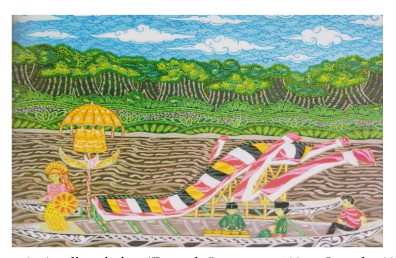
Figure 2: Acrylic painting "Barondo" on canvas 100 cm Length x 80 cm Width painted by Yelmi Nanda Resfi (Collection of Dinas Kebudayaan Provinsi Riau)

The next construction of the Malay-river-myth is depicted through an element of "Barondo", an ornamental boat that is full of decoration from the regency of Kuantan Singingi. This decorative boat is a tradition of the Kuantan Singingi regency that was designed to express the joy of the Malays in Kuantan Singingi in welcoming the Idul Fitri (Eid) festive season or other big events, e.g., boat races. The barondo is used by the Malays to express their gratitude to God for all His blessings to them and "to gain more blessed years ahead". The Barondo boat painting also illustrates the strong Malay culture concerning activities on the river (Figure 2). The principle signs in this painting are the image of the man dressed in Malay costume playing a musical instrument and dancing on the barondo. This study considers this to be sending a message that the Malays are "a happy and a blessed people with their rich culture". However, nowadays, the barondo activities are quite difficult to enjoy due to their rarity due to the lack of support from the local government for the events. This might be the reason why the painter came out with the idea of cultural preservation through Barondo.