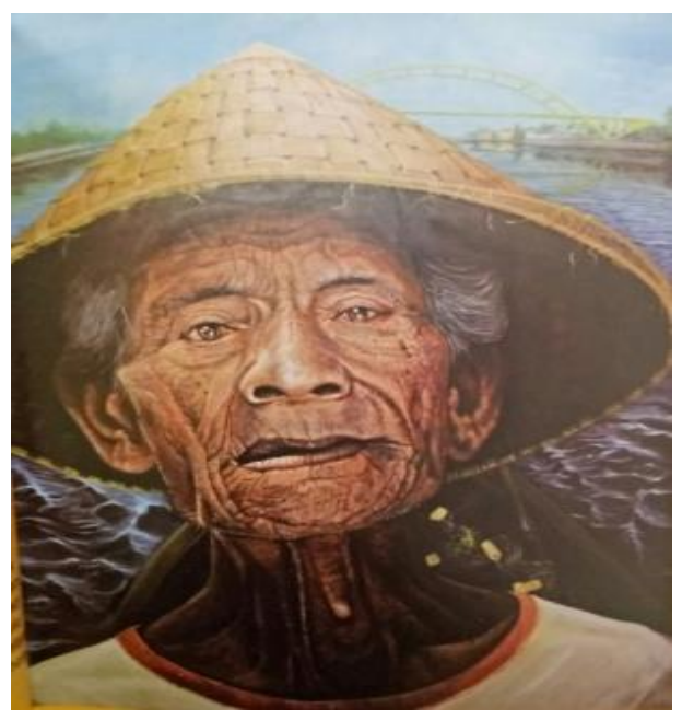
Figure 21: Acrylic painting "Colonisation Path" on canvas 143 cm length x 120 cm width painted by John) (Collection of Dinas Kebudayaan Provinsi Riau)

message through the old fisherman's face "marginalisation by the modern civilisation". As this painting depicts the bridge that becomes the symbol of modern civilisation in Pekanbarujust flies over the fishermen's life. It is likely trying to underline that this poor Malay fisherman does not receive any advantages from modern civilisation.