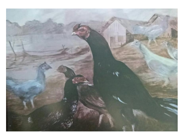
Figure 10: Acrylic painting "Ayam-Ayam Tepian Sungai" (Chickens by the River) on canvas 70 cm Length x 70 cm width painted by Dasril (Collection of Dinas Kebudayaan Provinsi Riau)

The painting entitled "Ayam-Ayam Tepian Sungai" (Chickens by the River) (Figure 10) constructs the Malay-river-spirit of life through the images of the river, boat, fisherman, and chickens. The chickens here are the images that are the focus of this painting. Although there are seven images of chickens, the black rooster is the principle sign in the painting. The rooster, in the Malay context, can be symbolically interpreted as courage and reliability. This painting also depicts the reliability of fishermen on the banks of the river. The fishermen are reliable people. Although their life is more and more threatened by modern civilisation, they continue to struggle to survive through their courage and their reliability. Indeed, poverty makes them suffer but does not cause them to die or lose hope.