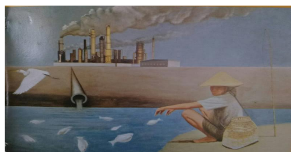
Figure 17: Oil Painting "Tercemar Limbah Beracun (Polluted by Poisonous Waste) on Canvas 100 cm Length x 140 cm Width by Rusli (Collection of Dinas Kebudayaan Provinsi Riau)

The painting entitled "Tercemar Limbah Beracun (Polluted by Poisonous Waste) (Figure 17) constructs the dark side of civilisation through the elements of a river, dead fish, birds, and factories that release smoke into the air and spew waste into the river. There is also a fisherman squatting on the banks of the river. This painting depicts the pollution that occurs in the river due to the toxic waste that flows into the river.