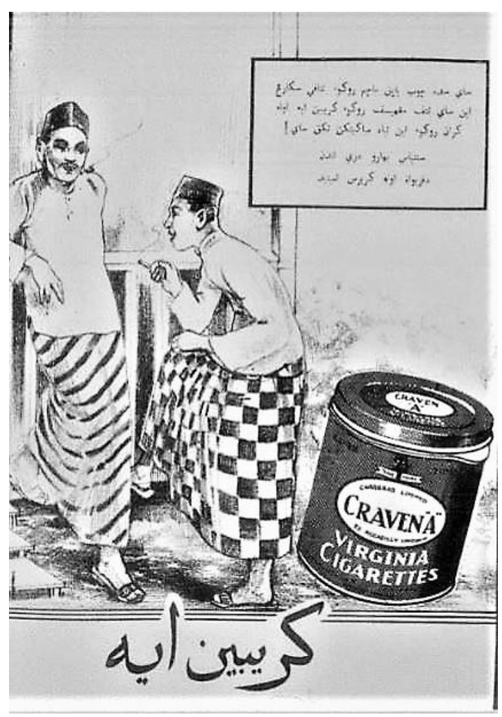
Figure 4: "I have smoke many cigarettes but now I stick with Craven A because it does not hurt my throat!" [Saya sudah cuba banyak macam rokok, tetapi sekarang ini saya tetap menghisap rokok Craven A oleh kerana rokok ini tiada menyakitkan tekak saya!], Warta Ahad, 5 July 1936

such as hanging out or playing card games. Smoking was considered a supplementary activity that increased the excitement of pastime activities such as displayed by the caption in Figure 5.