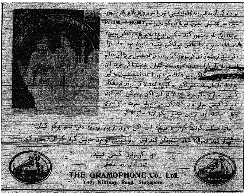
Figure 2: Laila Majnoon record, Warta Ahad , 14 July 1935

Another sought-after popular entertainment during that time was films. Cinemas in Malaya started to gain popularity as early as 1920s, mostly dominated by American films until early 1930s (Barnard, 2010). While it is difficult to gauge the popularity of cinema viewing amongst the Malays at the time, it is reasonable to say that these foreign films were appreciated, or at least known, by Malays-Warta Ahad allocated a section for film review, announcing new films currently show in local theatres. A case in point is one regular advertiser in Warta Ahad, the 'Lux Toilet Soap' that used an interesting approach to attract its Malay audience to buy its product. The growing films industry and popular culture in Malaya led to the incorporation of such entertainment into product advertising, such as in the form of collectibles. As shown in Figure 3, the brand gave free collectible photos of film celebrities in exchange of a certain, required amount of purchase of its products. Such advertising strategy would encourage bulk purchasing (but for a normal price per item) or a consistent purchasing until the buyer has met the required condition for the exchange. This would attract a percentage of the targeted audience to become regular buyers, thus ensuring a growing chain of consumption from its potential clients.