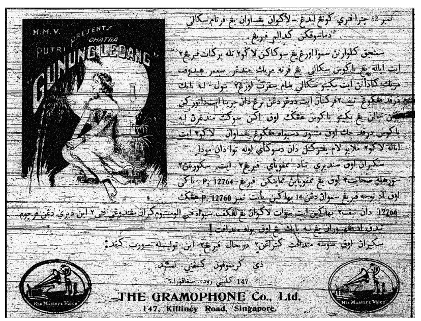
Figure 1: Puteri Gunung Ledang record, Warta Ahad, 16 June 1935 (Source: Perpustakaan Tun Sri Lanang, Universiti Kebangsaan Malaysia [UKM].)