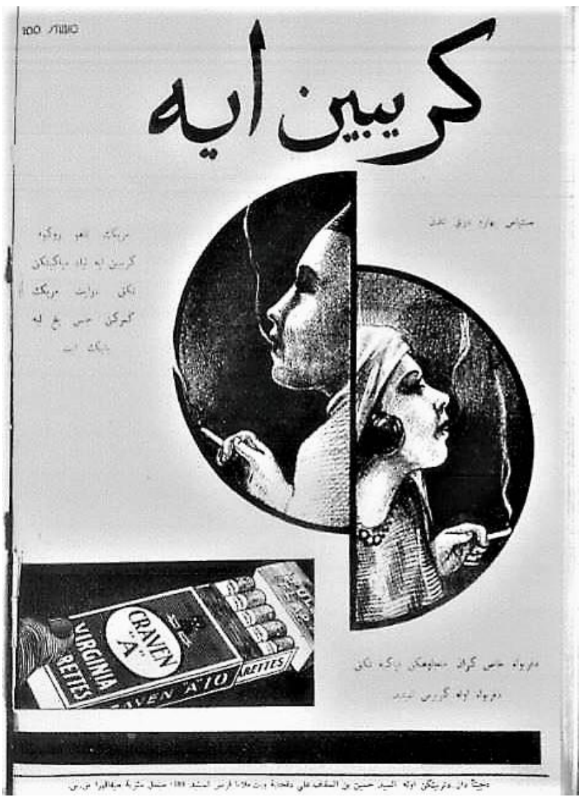
Figure 7: Craven A advertisement, Warta Ahad , 11 October 1936