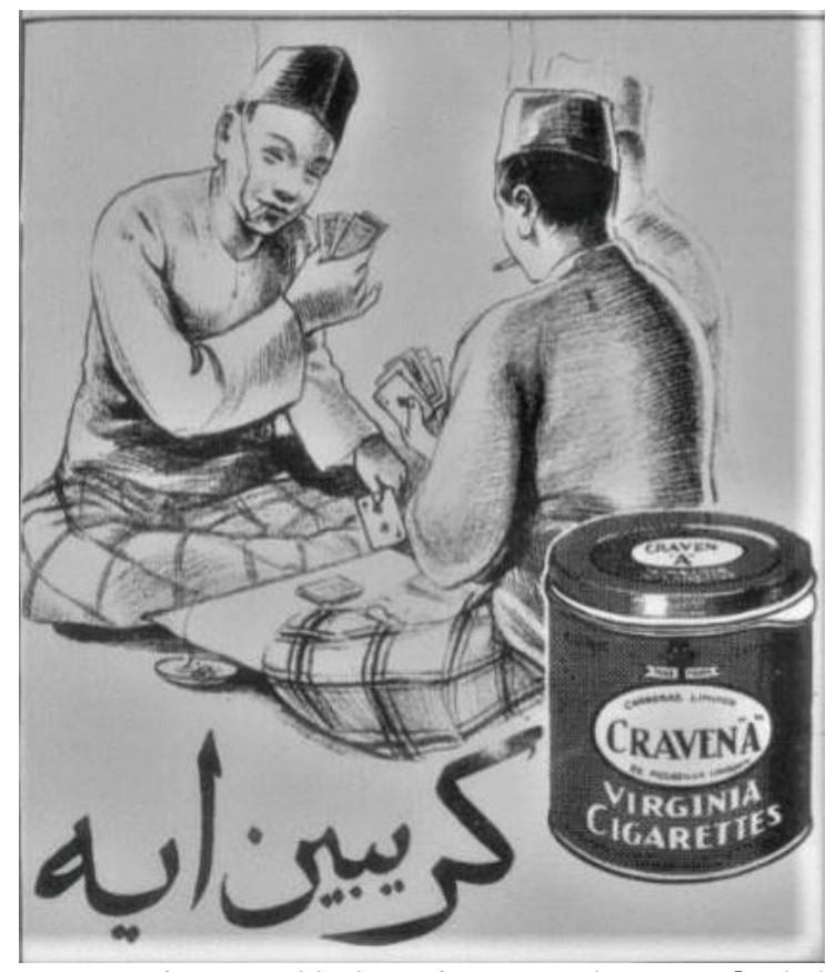
Figure 5: "Craven A cigarette adds the excitement to the game." [Rokok Craven A menambahkan lazat kepada permainan.], Warta Ahad, 10 May 1936