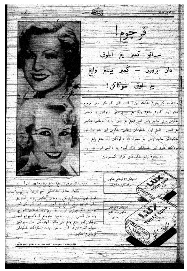
Figure 3: "Free! One fine and coloured photograph of popular actresses you admire!" [Percuma! Satu gambar yang elok dan berwarna—gambar bintang wayang yang awak sukakan!], Warta Ahad, 20 October 1935