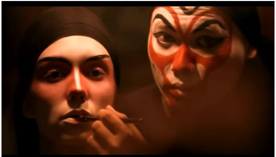
Figure 11 (left): Spinning top, 3:09-3:22 (12s), Figure 12 (right): Chines Opera make-up, 3:28-3:34 (6s)