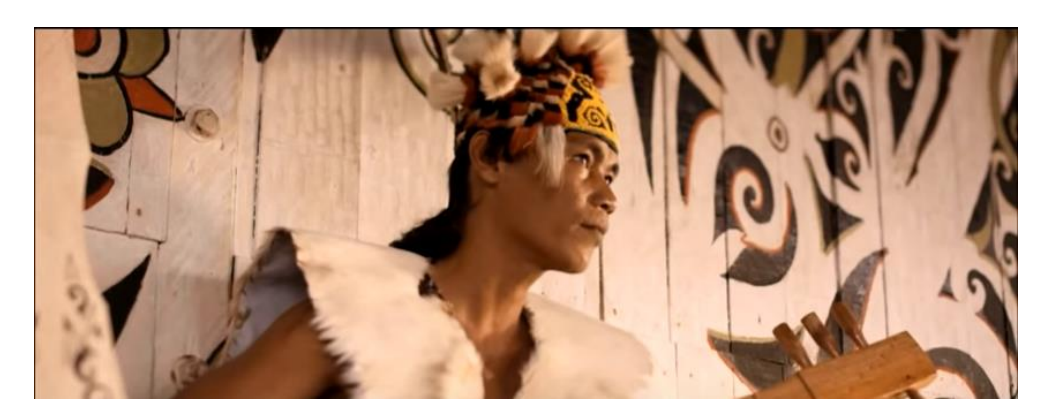
Figure 14: Sapeh music of Orang Ulu of Sarawak, 0:47-0:52 (5s)

Song composition in "The Essence of Asia" by Yuna (YoutTube, 2017-7 minute) is using a variety of Malaysia traditional styles and music accompaniment such as Seruling (flute), Pipa (Chinese classical instrument), Malay Gamelan, and Tabla. In this promotional video, music instrument featuring the Sapeh, string instrument of Orang Ulu (Sarawak) (figure 14).