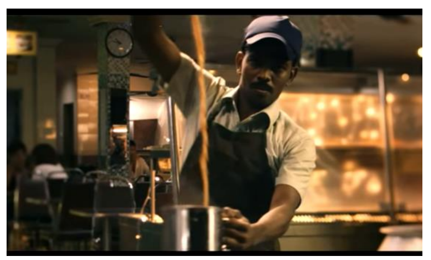
Figure 17: The Tarik, 5:34-5:38 (4s)