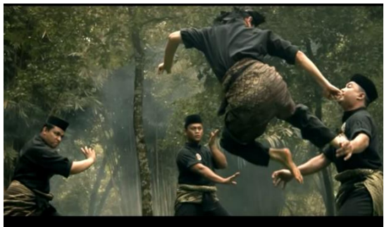
Figure 9 (left): Bharata Natyam (Indian Classical dance) 0:57-1:02 (5s); Figure 10 (righe): Silat (Martial art) of the Malay 2:48-2:57 (9s)