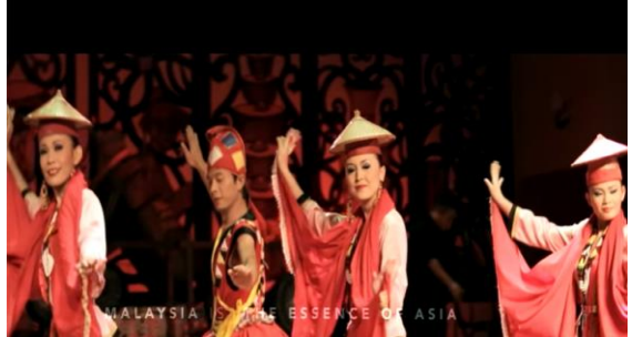
Figure 7 (left): Alu-alu Dance of Melanau of Sarawak, 0:53-0:56 (3s) 1:02-1:04 (2), 6:52-7:00(9); Figure 8 (right): Bidayuh 5:11 / 5:35 (2s), 5 minutes video