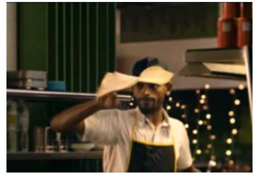
Figure 15: Satay 5:19-5:24 (5s); Figure 16: Roti Canai, 5:24-5:30 (7s)